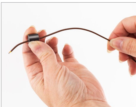
Step 1: String the ferrite core onto the thermocouple

Using the TC101A with an external probe routed through the ferrite core twice, the TC101A tested against RTCA/DO-160G for Emission of Radio Frequency Energy with satisfactory results.