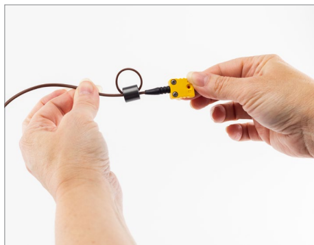
Step 4: Pull until the loop tightens around the ferrite core