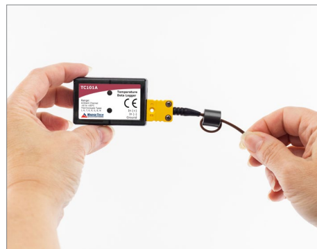
Step 5: Connect the thermocouple to the TC101A and use as normal