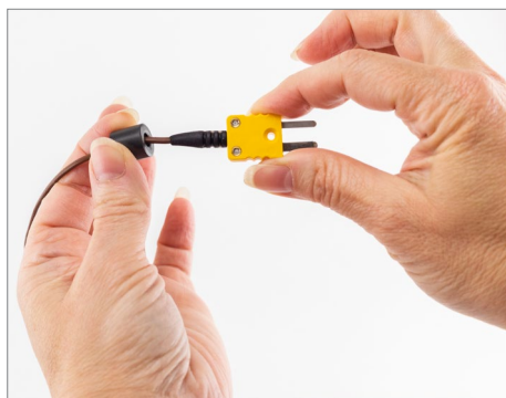
Step 2: Move the ferrite core close to the connector